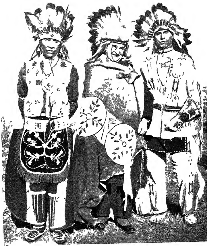
'BLACK CROW', 'RUNNING WOLF' AND 'STARLIGHT'